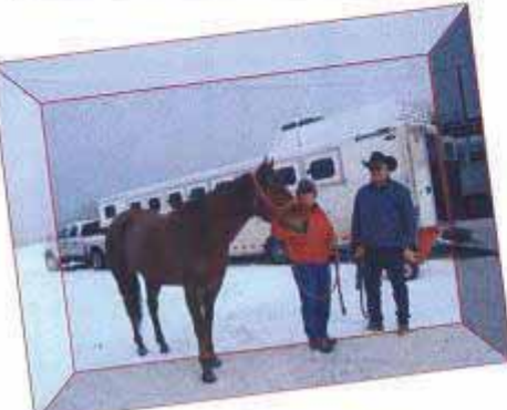
"Enjoy 4 mild Seasons... Work your horses year round"