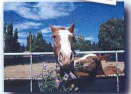
"Where the horses come first." Jackson Stables, Raton, NM