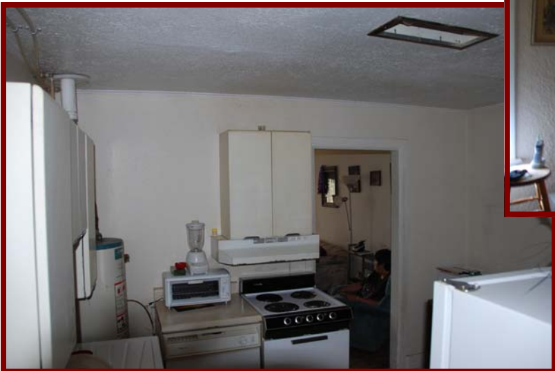
Handy location with lots of parking...