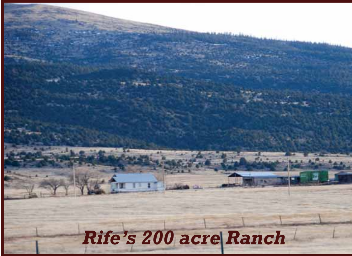
Rife's 200 acre Ranch

"Making a difference to the land and the people"