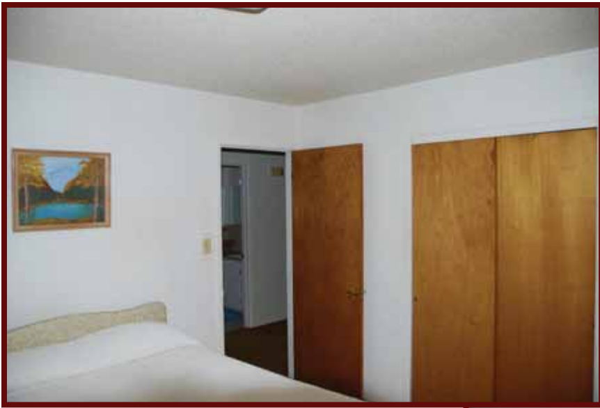
3 bedrooms with full bathroom off the hallway between the bedrooms and the living area.