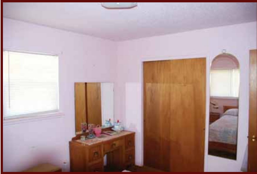
Each room has sliding doors on the closets.