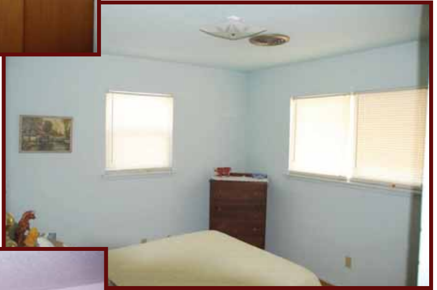
The windows in each of the bedrooms give them a comfortable sunny and spacious feel...