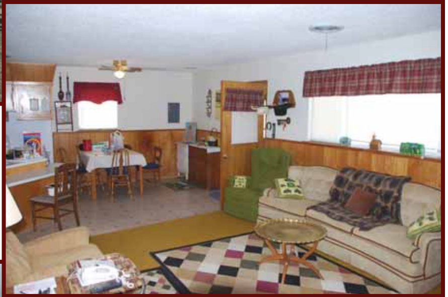
Efficient kitchen with lots of cabinet space and spot for washer and dryer. Along with breakfast bar looking out onto dining and living area.