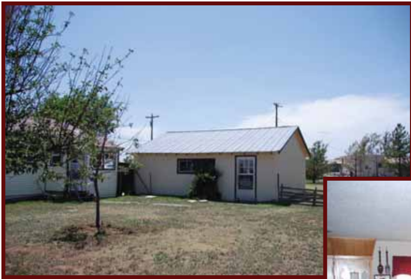
Entrance into garage - workshop and back porch of the home.