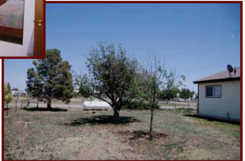
Fenced-in back yard with a large Pinon tree and fruit trees.