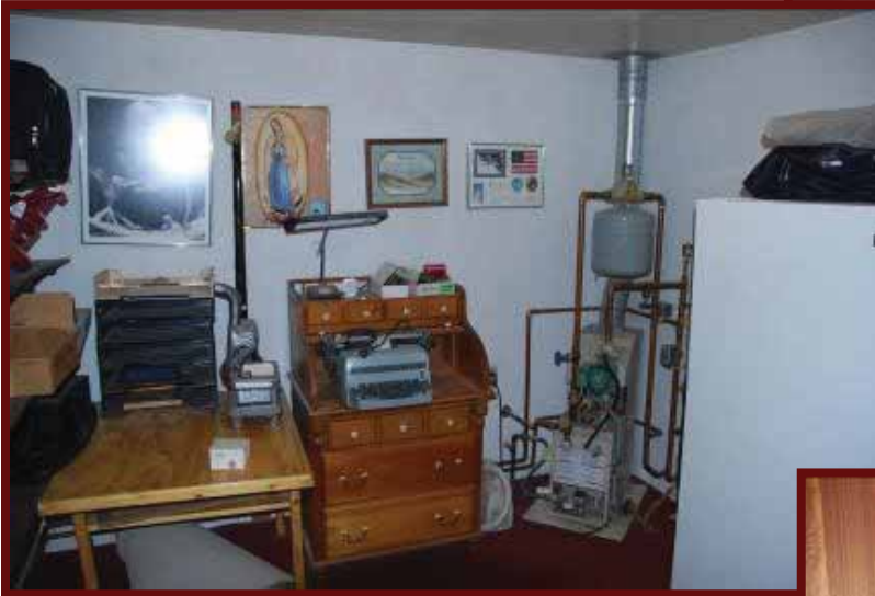
Come check out this home. It may be perfect for you!