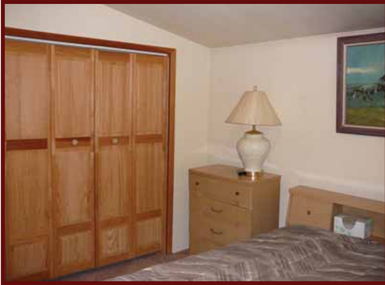
The master bedroom has plenty of closet space and storage.